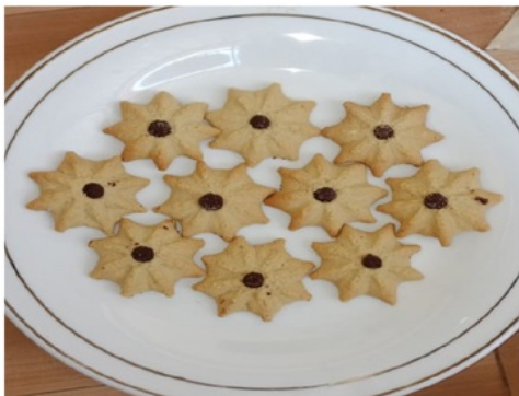
Fig. 3: Cookies Biscuit F3

The carbohydrate measurement procedure starts with weighing 5 g of samples and put into 500 ml Erlenmeyer, then added 200 ml of 3% HCl solution then cooled and neutralized with 40% NaOH using litmus or fenoltalein), then transferred into a 500 ml volumetric flask and diluted to the boundary mark, then filtered using Whatman 40 filter paper. The filter