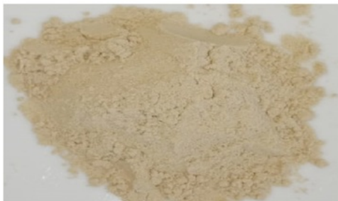
Fig. 2: Flying Fish Flour

The chemicals used for proximate analysis were aquadest ( H_2O ), sodium hydroxide, selenium, cuprum sulfate ( CuSO_4 ), red methyl indicator, sodium sulfate, indicator, hydrochloric acid 001 N, hydrochloric acid 3%, acid nitrate concentrated, sodium tetra borate, selenium catalyst, iodide kalium solution (KI 20%), sulfuric acid solution, boric acid solution 2%, SeO_2 , 25% K_2SO_4 , NaOH 30%, H_2SO_4 25%, H_2SO_4 1.25%, sodium thiosulfate solution