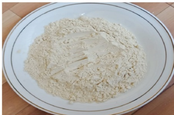
Fig. 1: Foxtail Millet Flour

Despite the fact that foxtail millet and flying fish are abundant 26 in West Sulawesi province, people remain under-utilized as a food source. It is only traditionally managed and did not extend to the entire community. Especially for flying fish which has a short shelf life and the quality of this food may be decreased depending on water content. 13 In addition, the production of flying fish does not exist at any time due to the influence of seasonal changes. As a results, people in the communities are rarely consumed this food. Therefore, a powdering process for this food may be a good way to maintain